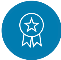
PRODUCE HIGHER-QUALITY VENEER