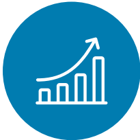
IMPROVE DRYING CAPACITY