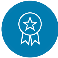
PRODUCE HIGHER-QUALITY VENEER