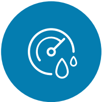
MINIMIZE OVER DRYING