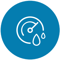
MINIMIZE OVER DRYING