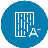
OPTIMIZED DRY VENEER GRADING