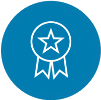
MAXIMIZE VENEER QUALITY