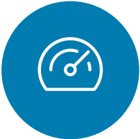
OPTIMIZE PRODUCTION EFFICIENCY